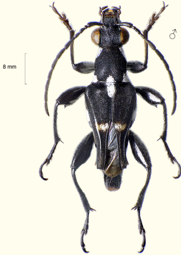
Ercysis luctifera (Fairmaire, 1893)